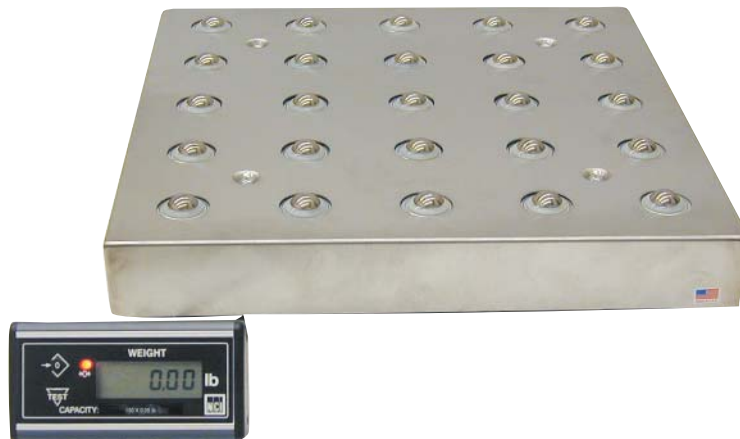
NCI Model 7885 shown with optional ball-top weight platter